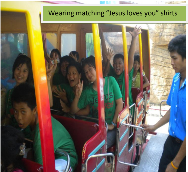
Wearing matching "Jesus loves you" shirts