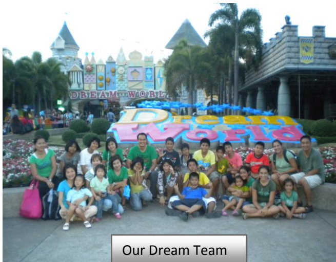
Our Dream Team