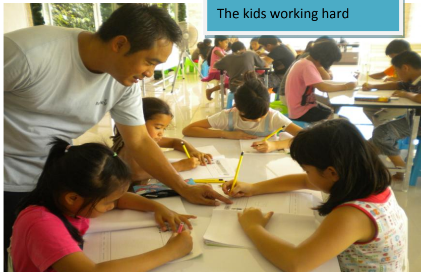
The kids working hard