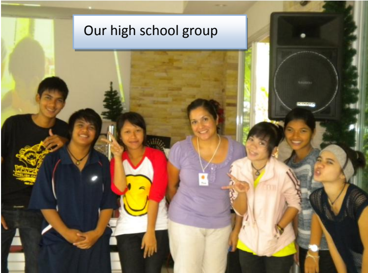
Our high school group