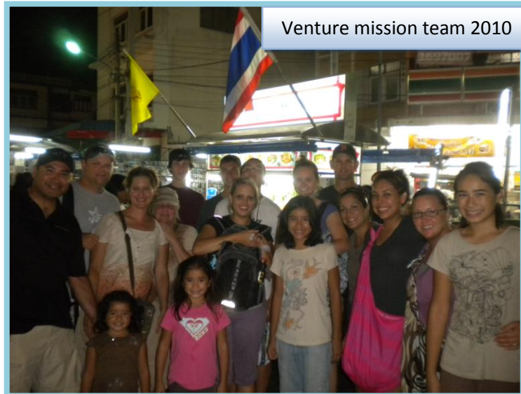
Venture mission team 2010