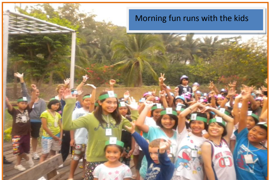
Morning fun runs with the kids