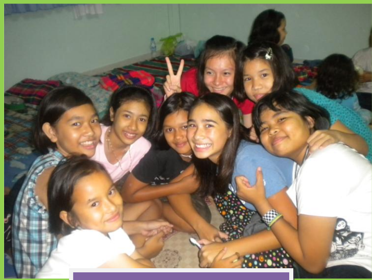
Faith making some new friends

In Thai society if you don't fit into a category, you don't belong. To think for yourself or express your opinion outside of the group is going against the traditions you were raised up in and thus you are literally going up against your family. Please pray for God's wisdom to be poured out on the Thai youth and that they will learn to be content with who they are.